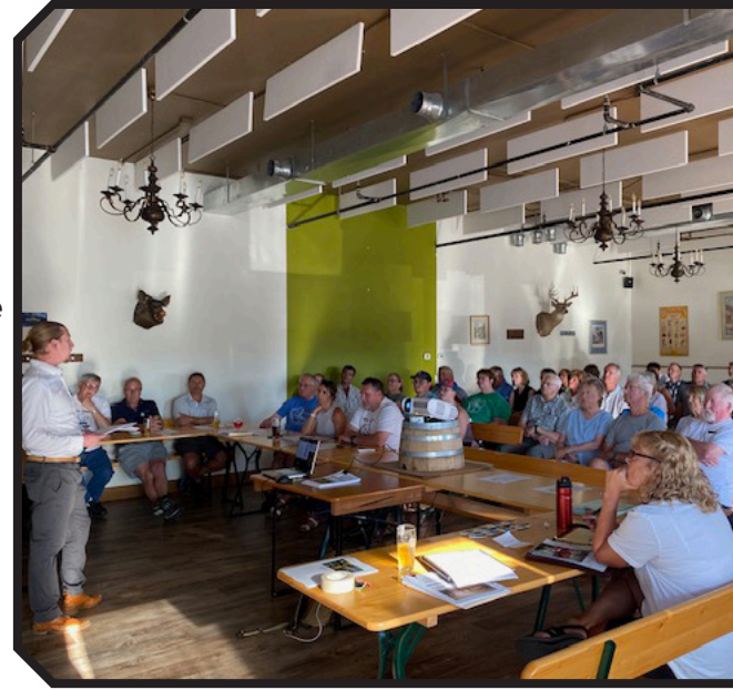
Fifty community residents attend the July meeting with Bolton & Menk at Giesenbrau.